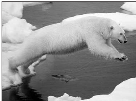
Ice running out for Polar bears

He said everyone now knows that the US is the world's biggest polluter, and that with only a 20th of the world's population it produces a quarter of its greenhouse gas emissions.