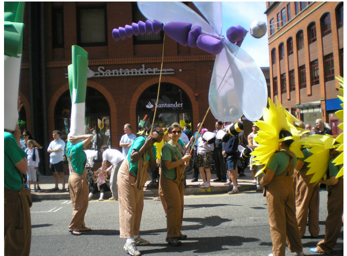
Event producers Walk The Plank were pleased with how well it went, and all involved had a brilliant time. I hope they do it again next year and, if they do, you should definitely come along and join in the fun!

Although the event brought many people together to work creatively, from a recycling standpoint it would have been even better if materials used for props and costumes had been sourced from recycled materials or trash instead of virgin resources. This would have made the event less wasteful. And we would have liked a vegan snack afterwards – however, this didn't detract from the fun!