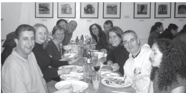
And of course the Christmas Social...