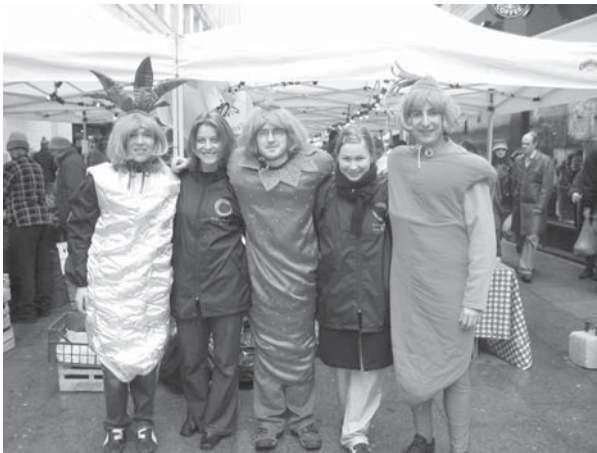
Launching our 'Earth Mover' award-nominated Real Food Guide. The category for award was "Inspirational Voice". Next year we are aiming for 'best costumes and hair styles.'