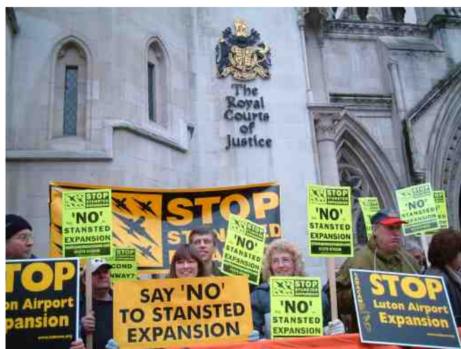
Protests against planned expansion of Stansted Airport.

November 29th Campaigners delighted by Uttlesford Council's decision to turn down BAA's planning application to increase Stansted passenger numbers to 35m a year. Among the reasons given for this decision: climate change. The economic benefits, they stated, had not been demonstrated to be strong enough to outweigh all other factors.